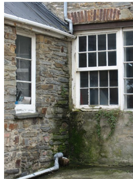
Blocked or cracked gutter causing damage to wall below