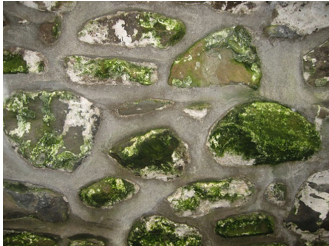
Cement pointing leading to mossy masonry