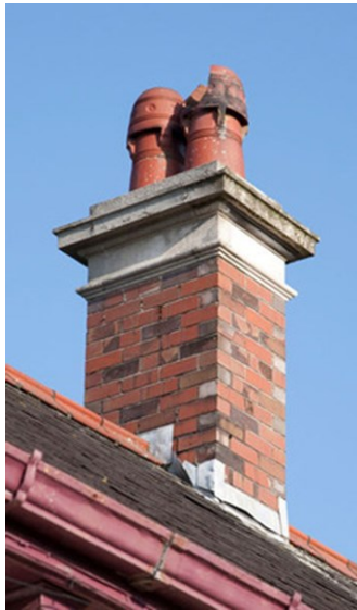
Broken chimney pot