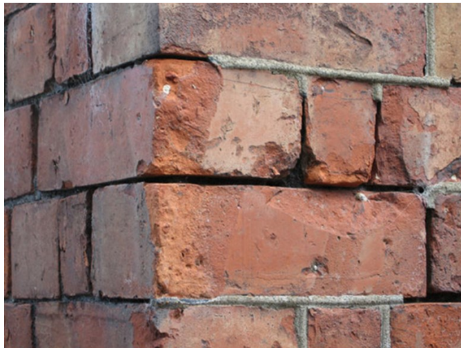
Damaged or missing pointing between bricks