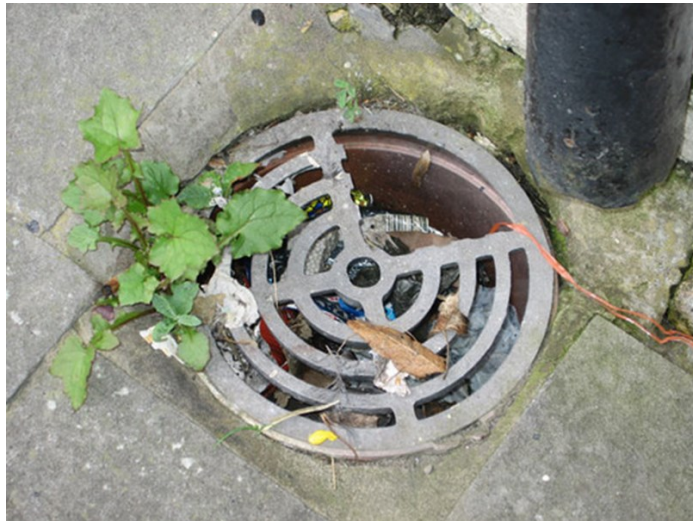
Broken drain covers