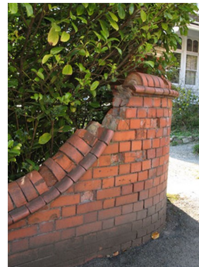
Missing capstones on boundary wall