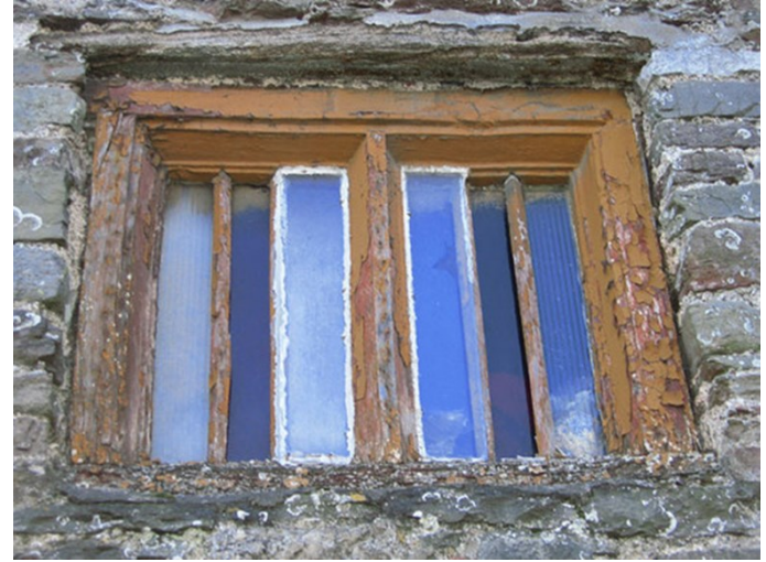
Damaged mortar around windows