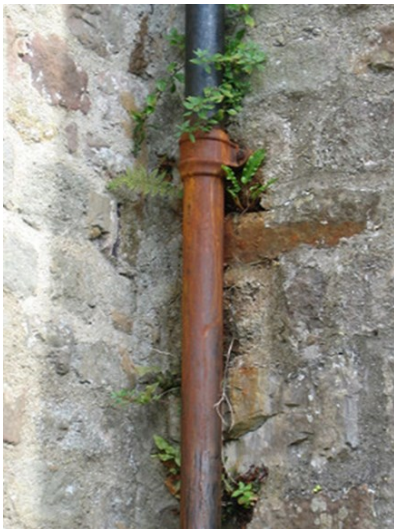
Vegetation growing in downpipe or gutter