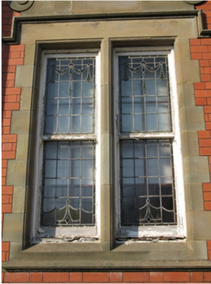
Flaking paint on window frames