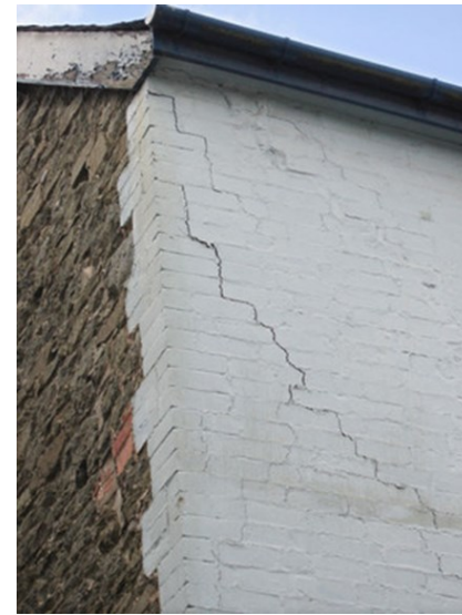
Cracked or bulging brick or stone work