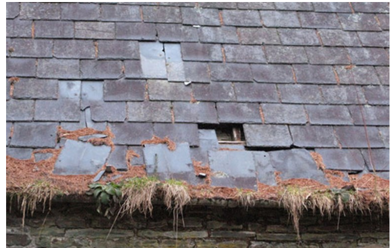
Slipped slate or roof tiles