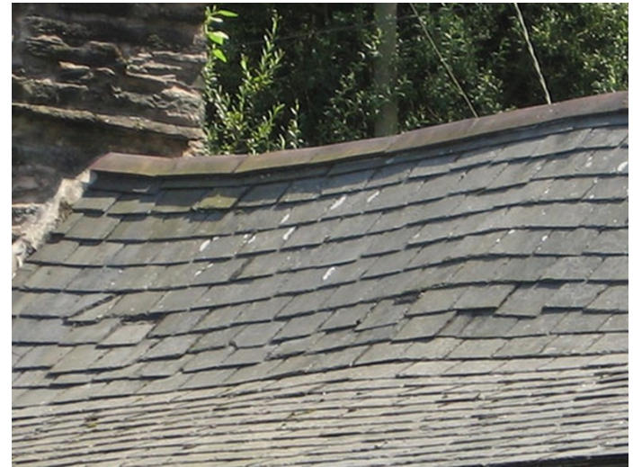
Structural damage to roof frame