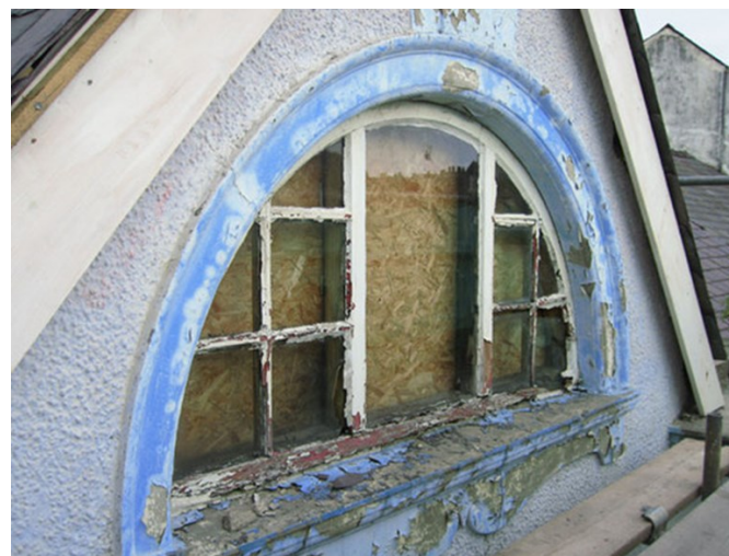
Missing or broken glass