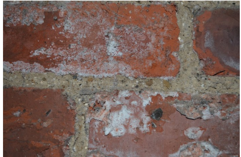
Salts rising to surface on bricks or masonry