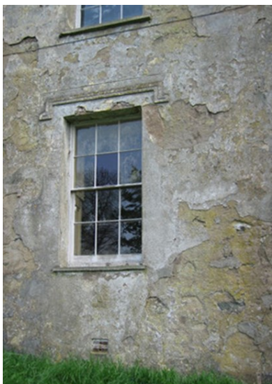
Damaged or poorly applied render