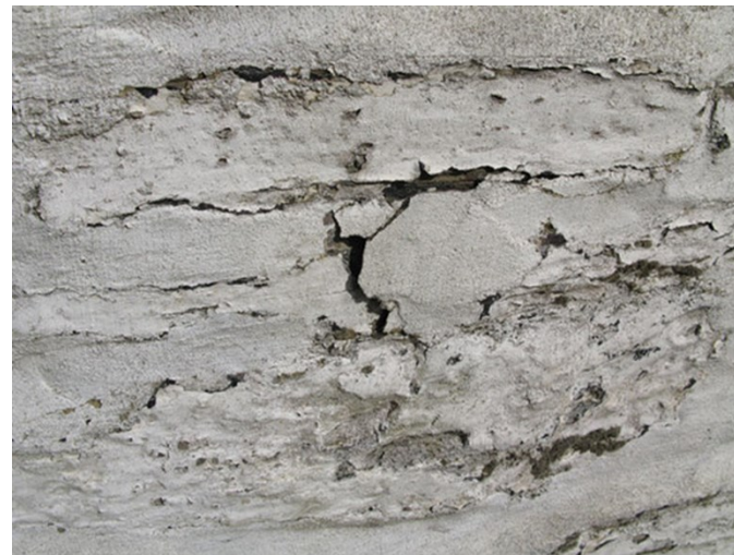
Flaking paint over stone