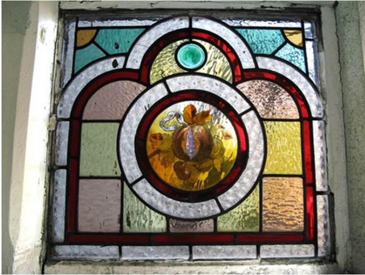
Damaged stained glass