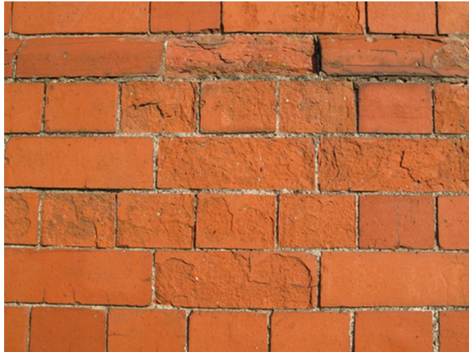
Damaged brick faces