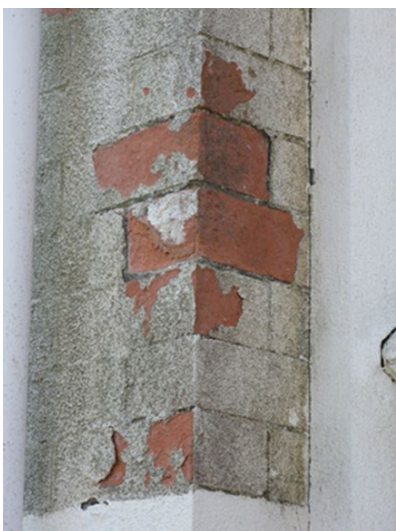
Peeling paint over bricks