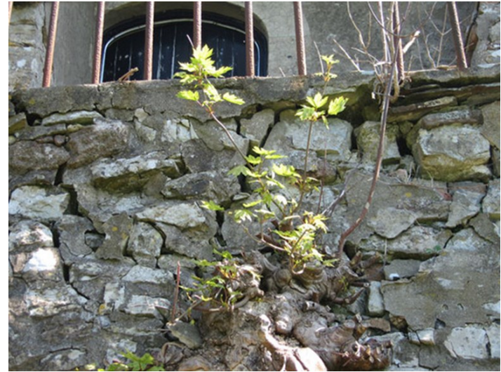
Vegetation growing in walls