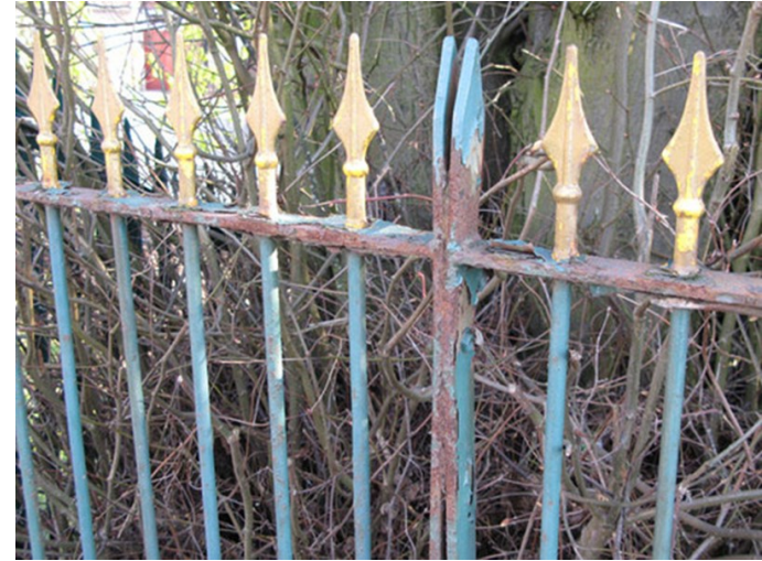
Peeling, broken or rusty railings