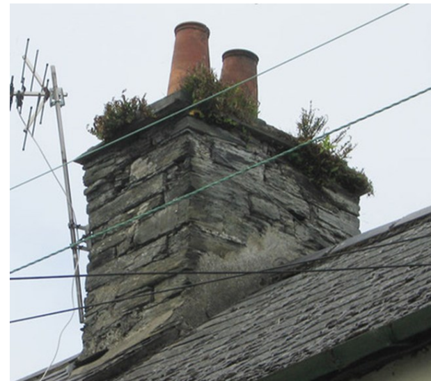
Vegetation growing from chimney, or damaged chimney