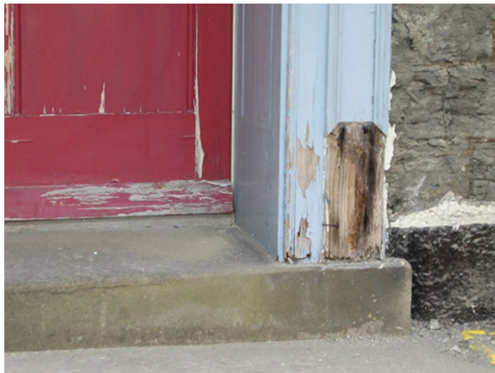
Decaying door frame