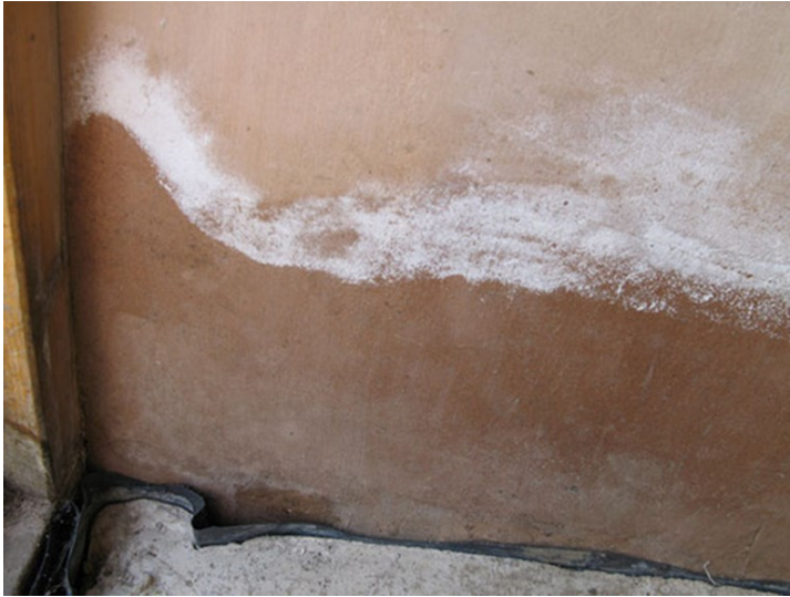
Salts on wall due to raised ground levels