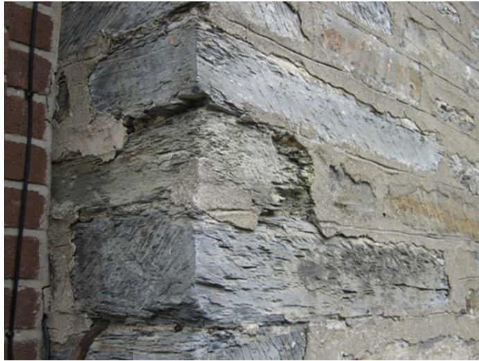
Decaying stone caused by cement render or pointing